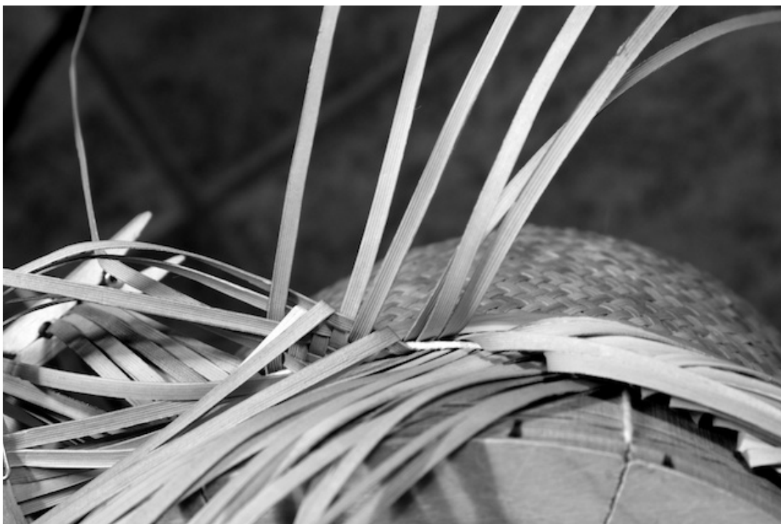
Ulana leaving a kū standing on the left. Continue weaving the two maka until you puni. Keep pulling the work to the right.