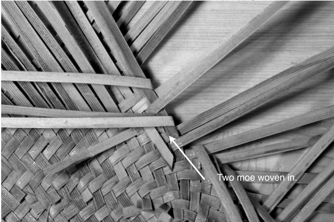
Here we have woven two more moe after the hāunu. Time to add again.