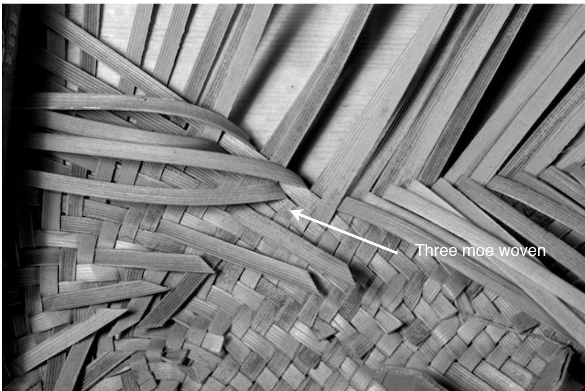
Keep adding after every two moe until it gets tight on the long side. Then add after three moe are woven.